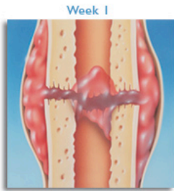
Hematoma (or Inflammation)

“When your feet hurt, you hurt all over”